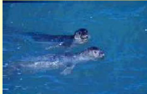
Pair of Monk seals swimming.

The species highlighted by WWF today are the Iberian Lynx, the brown bear, the Harbour Porpoise, the Monk Seal, the Loggerhead Sea Turtle, the Freshwater Mussel, the Atlantic Salmon, the Marsh Fritillary Butterfly, Lady's Slipper Orchid and the Corncrake.