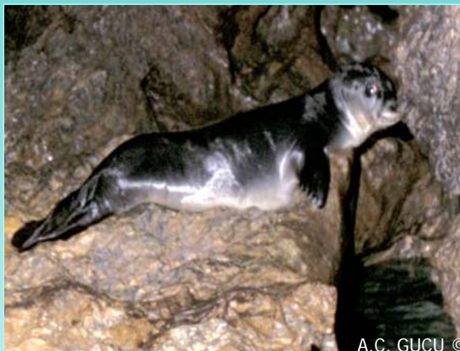
A.C. GUCU ©