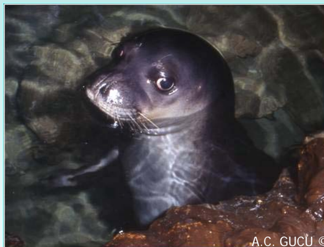
A.C. GUCU ©